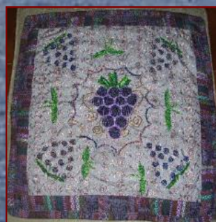
Top quality beaded pillow covers

More people give their hearts to Jesus - Amen!