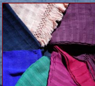
Cotton Scarves Beautifully finished